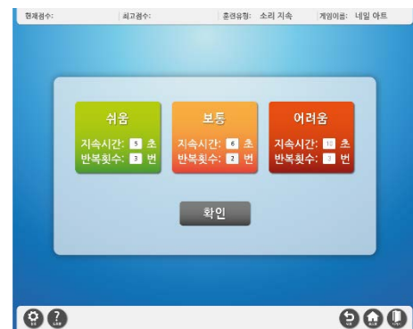
Figure 5. Duration & Repetition Setting

playing one scenario all the time. Different scenario ideas were developed, including sports, traditional Korean games, as well as modern-theme inspired games. We present five different scenarios for each game category. Each scenario was developed under the guidance of medical doctors from Medical Device Clinical Trial Center, Chonbuk National University Medical School.