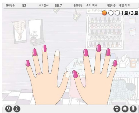
Figure 3. Nail Art Game (Continuity Training)

Continuity game requires players to make voice continuously. Continuity training might help improvement of controlling how long they need to make voice. For continuity games, the therapist may adjust duration (how long patient needs to make voice continuously). The therapist can also determine the repetition (how many times games will be conducted). Before the game is played, therapist may adjust minimum loudness target easily by comparing with real time voice recorded.