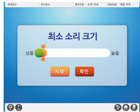
Figure 4. Voice Target Setting

Application development begins with game scenario development. Various game scenarios are provided for each game category in order to overcome boredom in